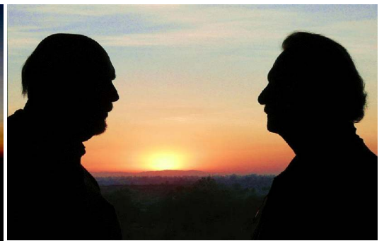
And there was a beautiful sun set with some unknown members.