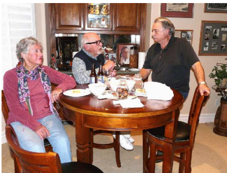
There was conversation.