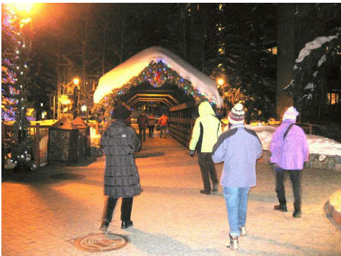
THERE WAS SOME SCENERY