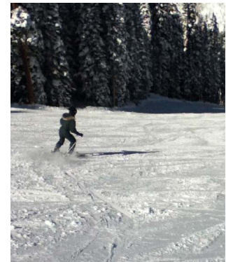
AND EVEN SOME SKIING