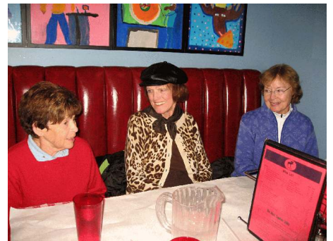
THERE WAS A LOT OF EATING